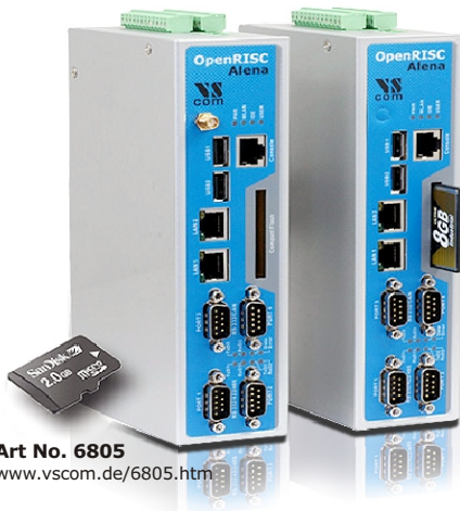
Art No. 6805 www.vsc.com.de/6805.htm

RISC-CPU based industrial embedded computer with CAN port